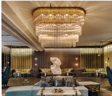
THE GWEN - Chicago