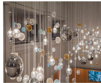
SHERATON BAY POINT - Panama City, FL